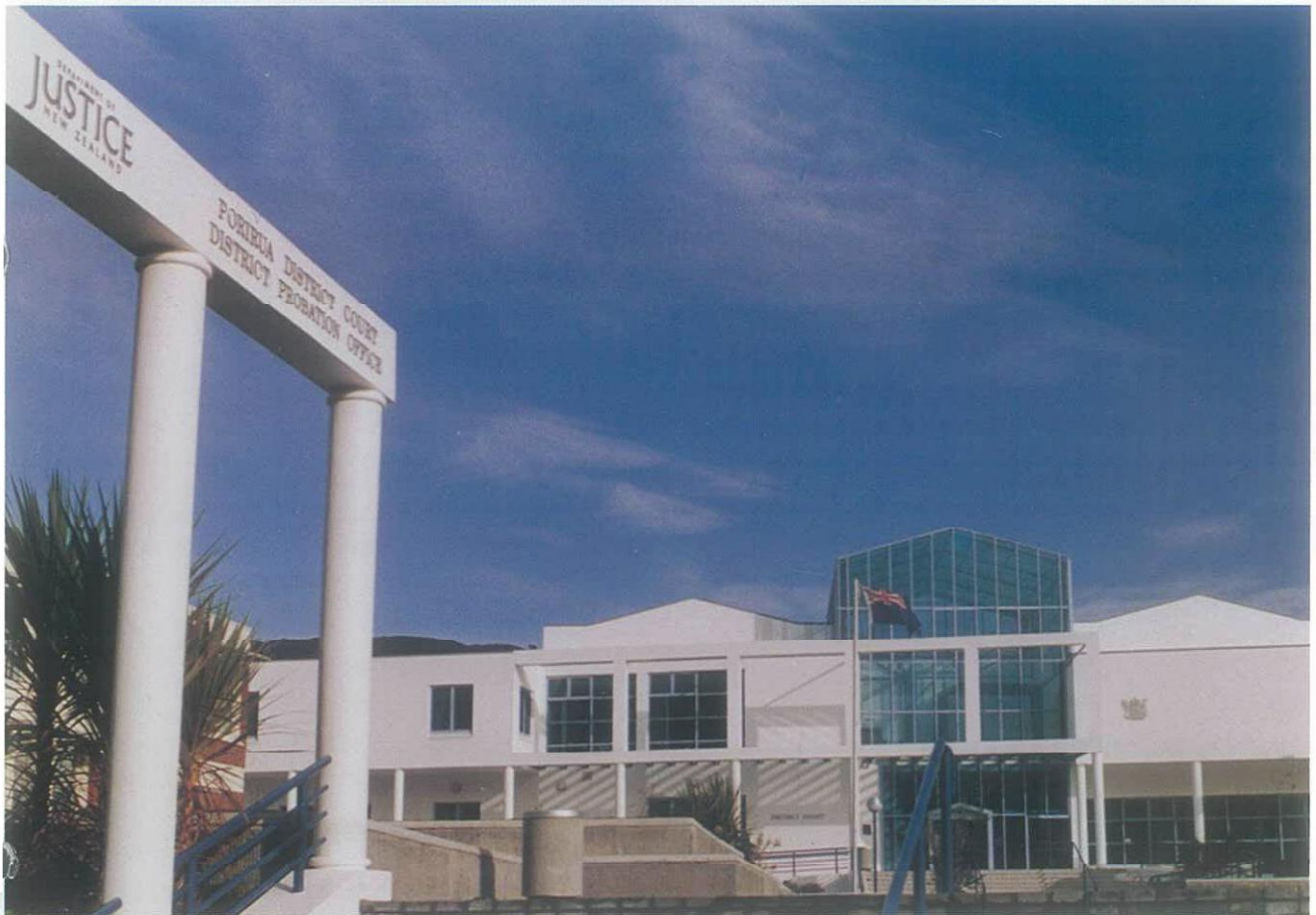
Porirua Court House waterproofed with SEALFLEX