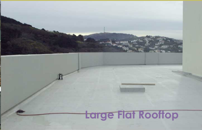
Large Flat Rooftop